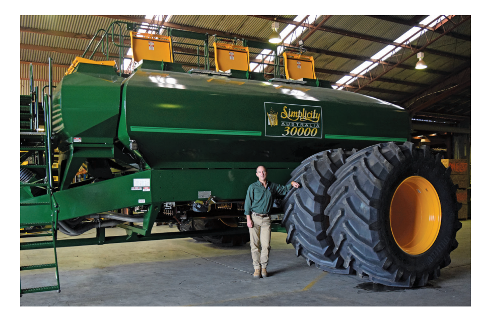
Big capacities: The 30 Series Simplicity air seeder can be up to 30,000 litres capacity.

Local supporters: Almost 100 staff are employed by Simplicity Australia.